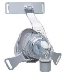
Philips Respironics' TrueBlue gel nasal mask

Philips Respironics is dedicated to helping caregivers establish better sleep and breathing for millions of people worldwide. Based on patients' unique needs, we develop solutions designed to encourage long-term compliance with therapy. The new TrueBlue gel nasal mask is designed to deliver a higher degree of comfort, stability and the freedom to move with minimal adjustments.