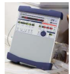
CareFusion's LTV Ventilator

The LTV® Series Ventilators from CareFusion give patients portable advanced care ventilation in the home or at a post-acute care facility. At 14 lbs and roughly the size of a laptop computer, the LTV Ventilator features complex ventilation configured for convenience and mobility. Smoothly transition your patients from the hospital to home with the same ventilator settings and cost savings.