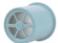
PMV® 007 (Aqua Color™)

The Passy-Muir® Swallowing and Speaking Valve is the only speaking valve that is FDA indicated for ventilator application. It provides patients the opportunity to speak uninterrupted without having to wait for the ventilator to cycle and without being limited to a few words as experienced with "leak speech." By restoring communication and offering the additional clinical benefits of improved swallow, secretion control and oxygenation, the Passy-Muir Valve has improved the quality of life of ventilator-dependent patients for 25 years.